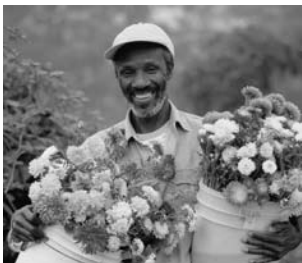
A picture that looks clear today...

Take the test on the other side of this card to find out if you may be at risk for getting glaucoma.